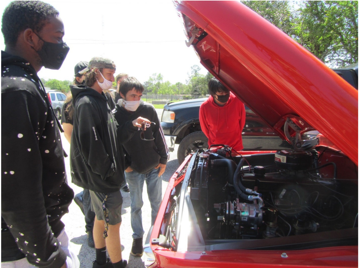
This Ford F-100 has a vintage air system that was installed in the shop. This is the perfect accessory for classic cruising in Florida!