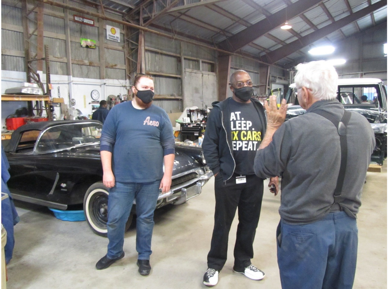
Several pickup truck projects could be seen at various stages in the restoration process. This Ford was one of the examples close to completion.