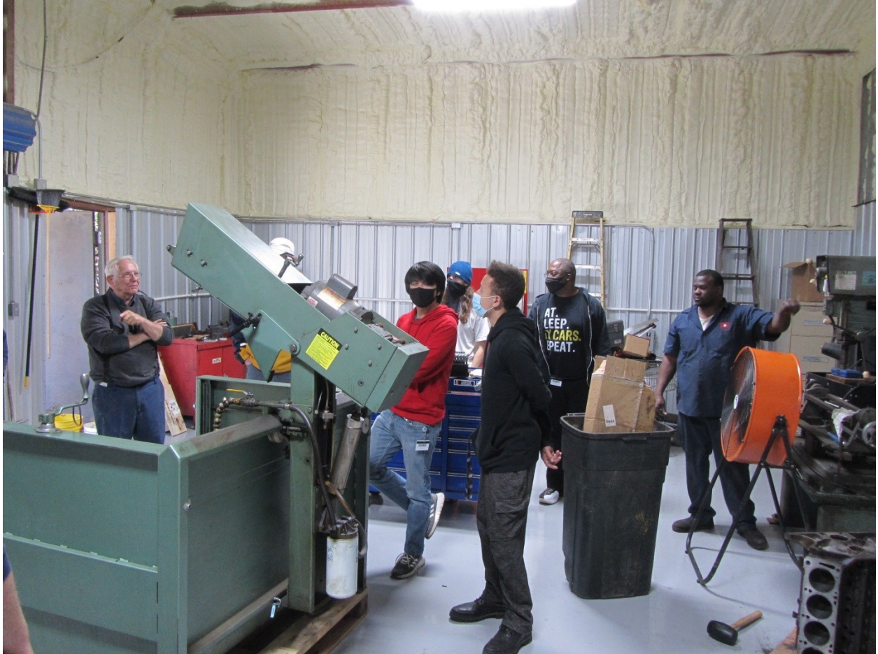
A short walk to out buildings used for preparation and storage yielded interesting artifacts like this Ford Thunderbird...