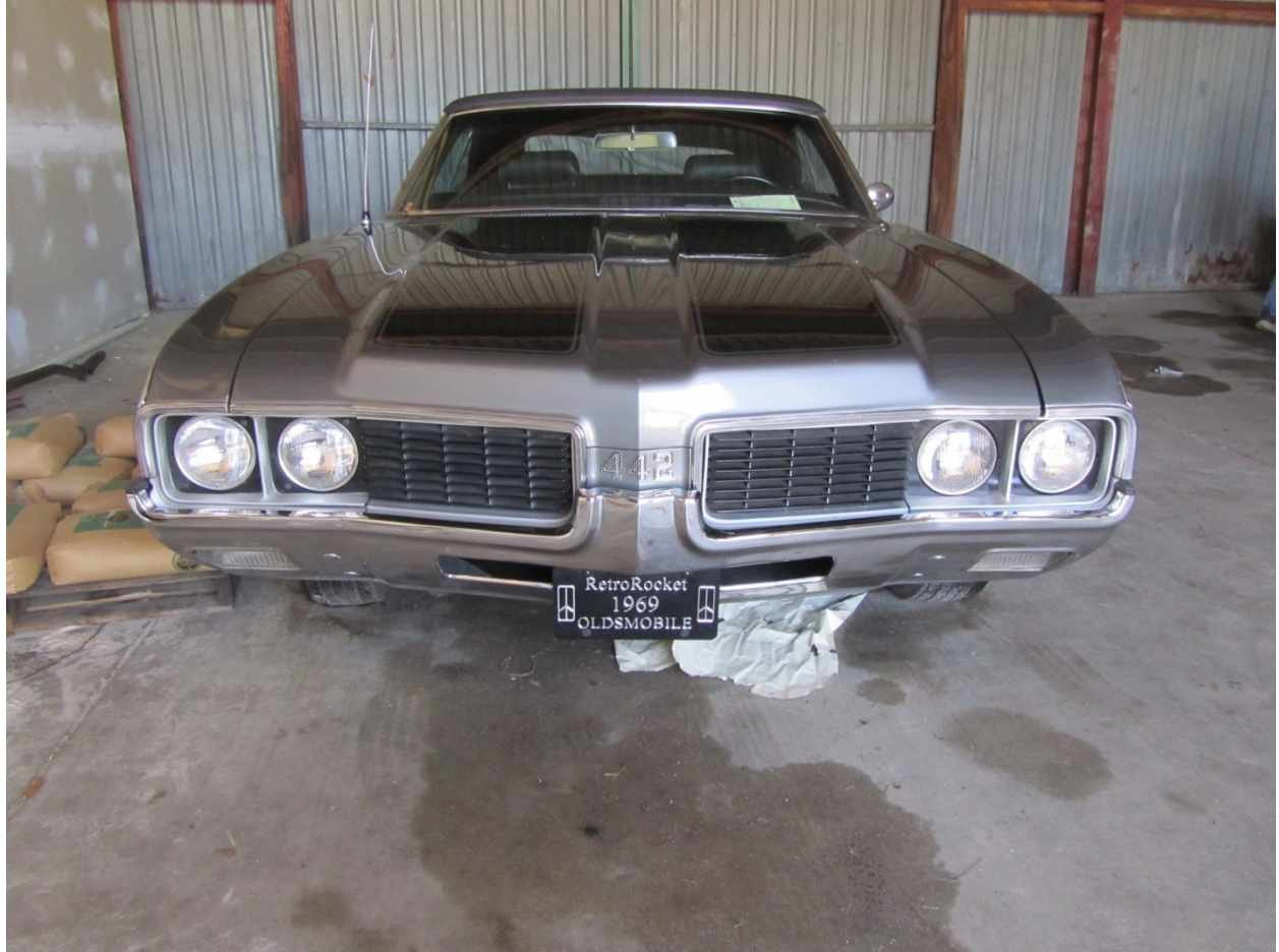
...and a 1969 Oldsmobile 442.