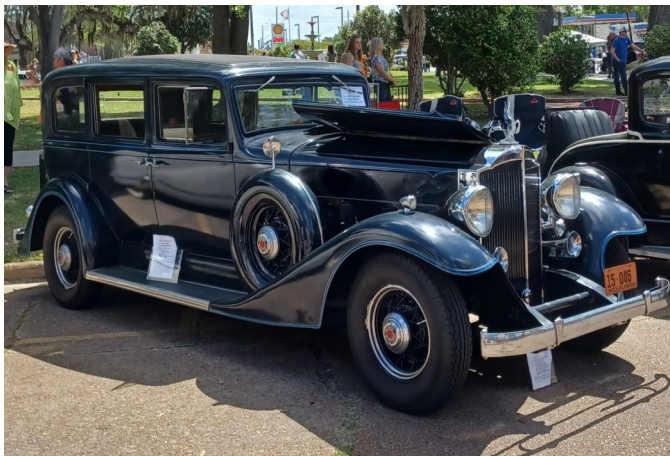
Honor Flight Show in November.