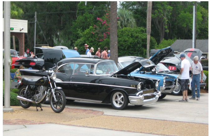
Watermelon Festival June 2022