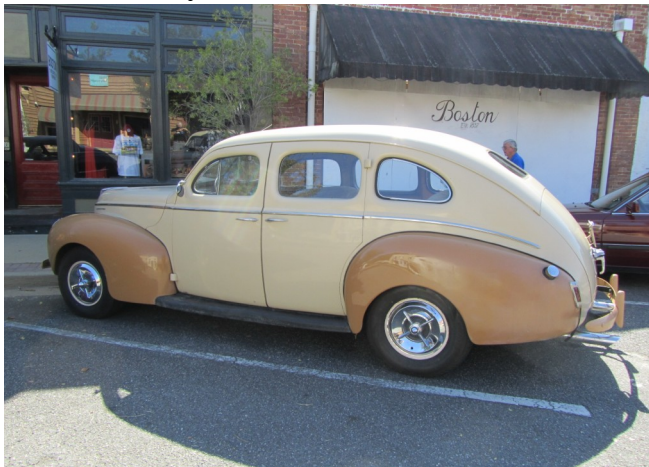
Boston Ga tour