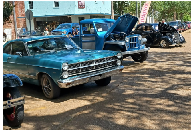
Madison Down Home Days April