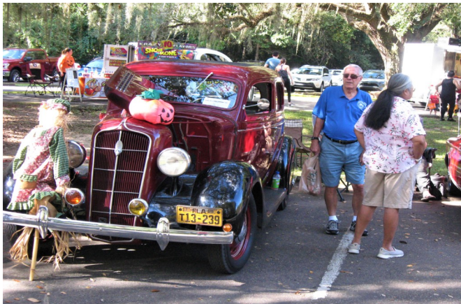
McClay Gardens Halloween Show