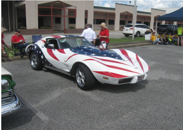
Lions Club Show