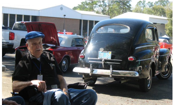
Lively Car Show in March 2022