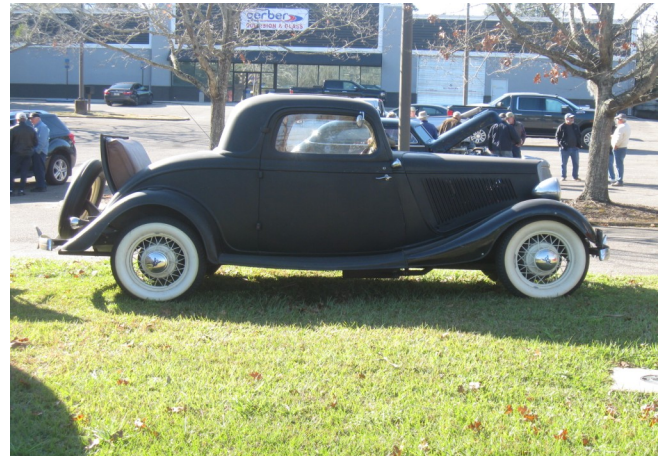
Neal Davis' 1934 Ford Coupe at C+C