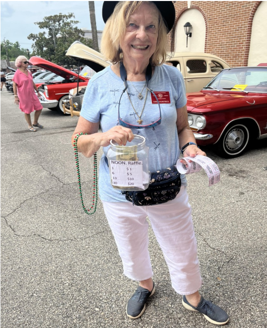
KK selling 50/50 tickets. Great Job!!!!