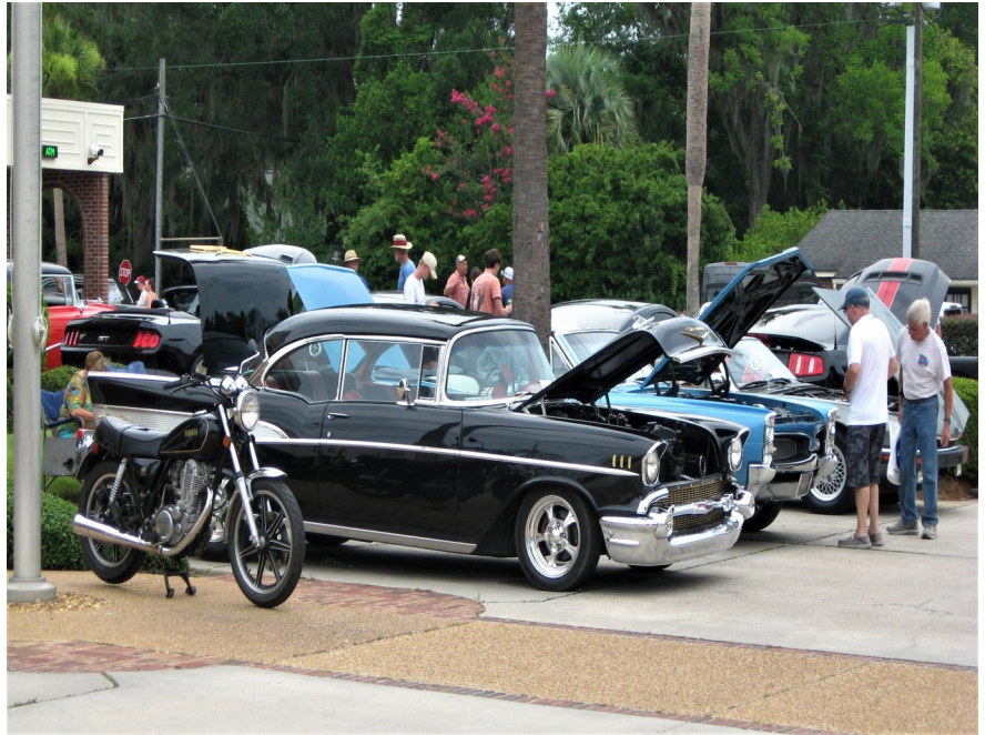
Line of show cars. Beautiful 57 Chevy.