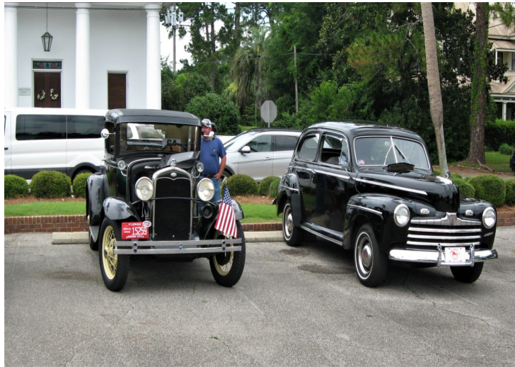
Honeybun 1931 Ford and Wally 1946 Ford