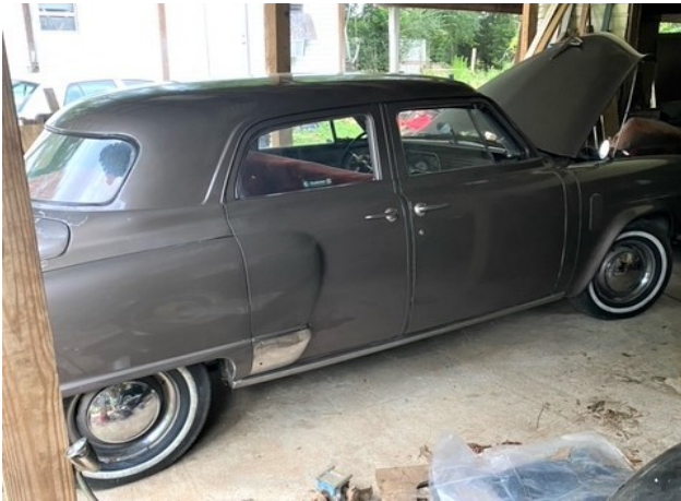
1950 Studebaker Champion. Very nice condition, interior nice. Asking $12,500.00