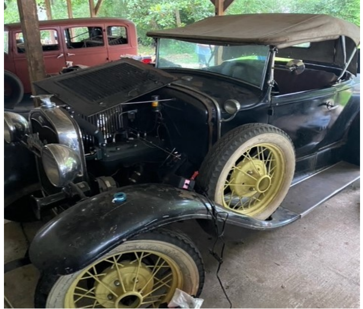
1932 Model A Roadster. Asking $15,000.00