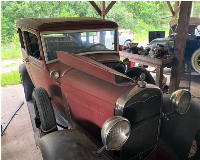
1931 Ford 4 door Sedan. Asking $10,000.00