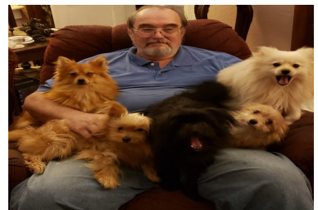
The whole gang is ready for 2023!