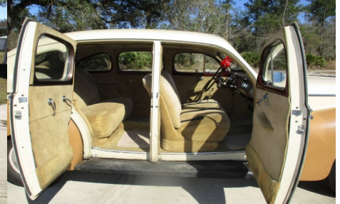
From Cars and Coffee. Nicely built Street Rod.