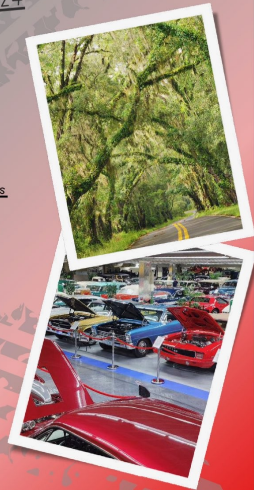
CANOPY ROAD

For More Info About the show or if interested in becoming a vendor text Megan at 904-305-3076 or Email traacashow@gmail.com Visit tally.aaca.com for more show info