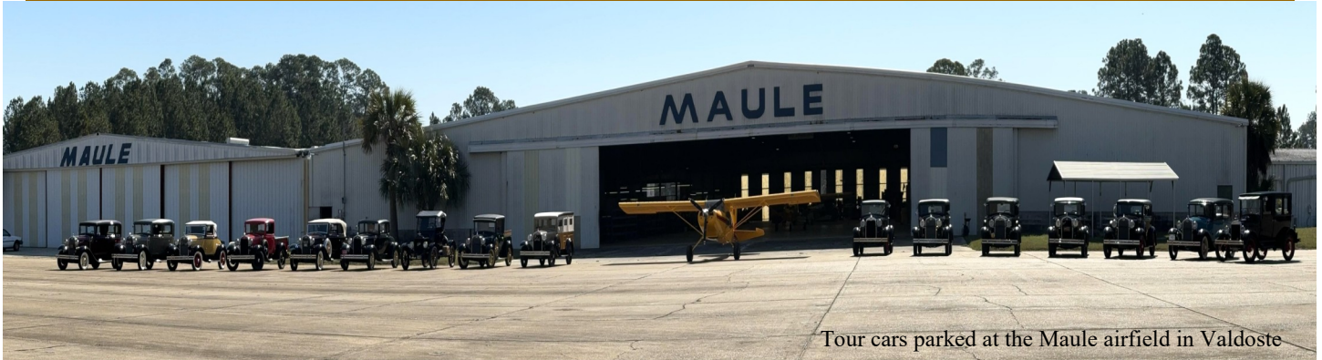
Tour cars parked at the Maule airfield in Valdosta