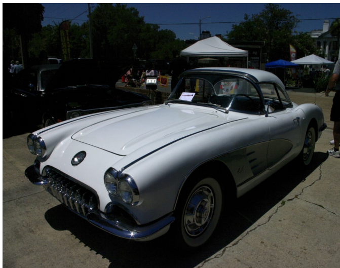
1960 Chevy Corvette / Best 1951-1960