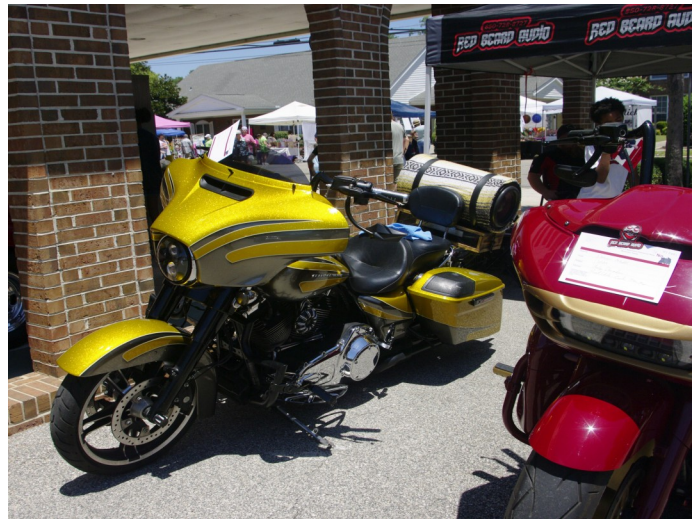
2014 Harley Street Glide / Best Motorcycle