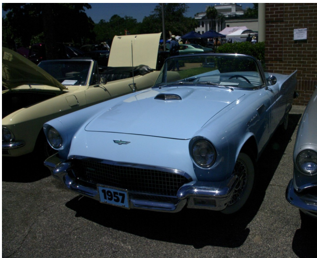
1957 Ford Thunderbird / Best 1951-1960