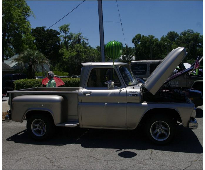
1965 Chevy C-10 . Best Truck