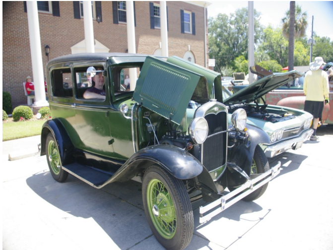
1931 Ford Model A / Best 1931—1940