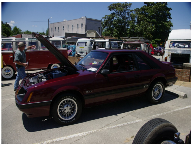
1986 Ford Mustang / Best 1981-2000