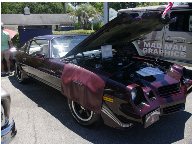
1980 Chevy Camaro / Best 1971- 1980