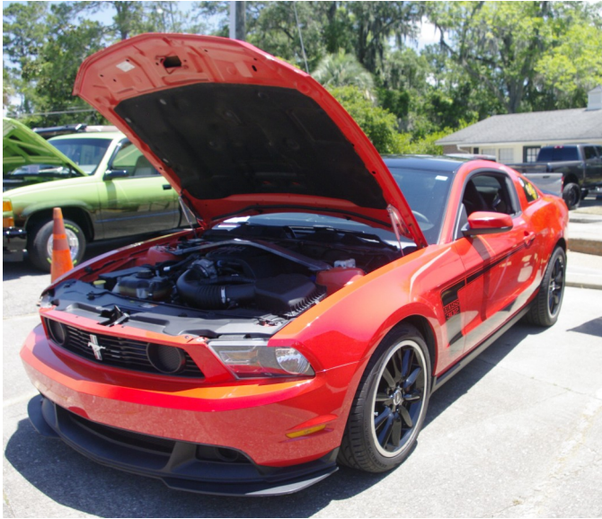
2012 Ford Mustang Boss 302 / Best 2000– up