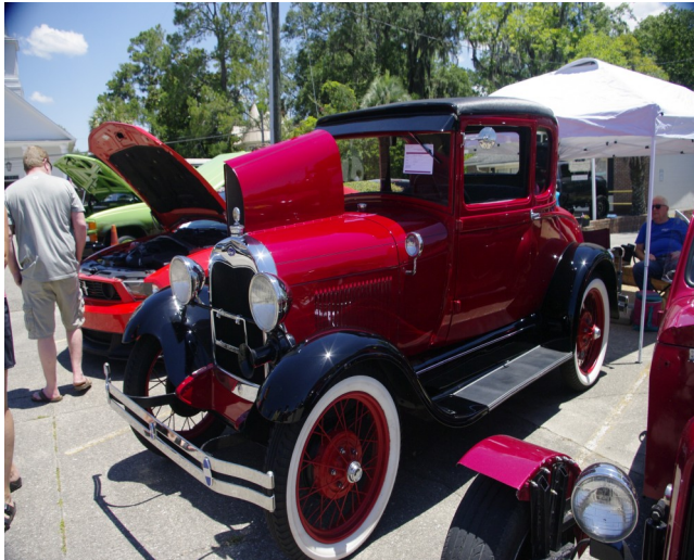
1929 Ford Model A / Best Pre 1930