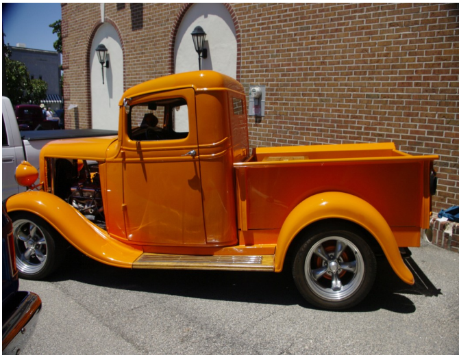
1935 Chevy Pick Up/ Best Hot Rod