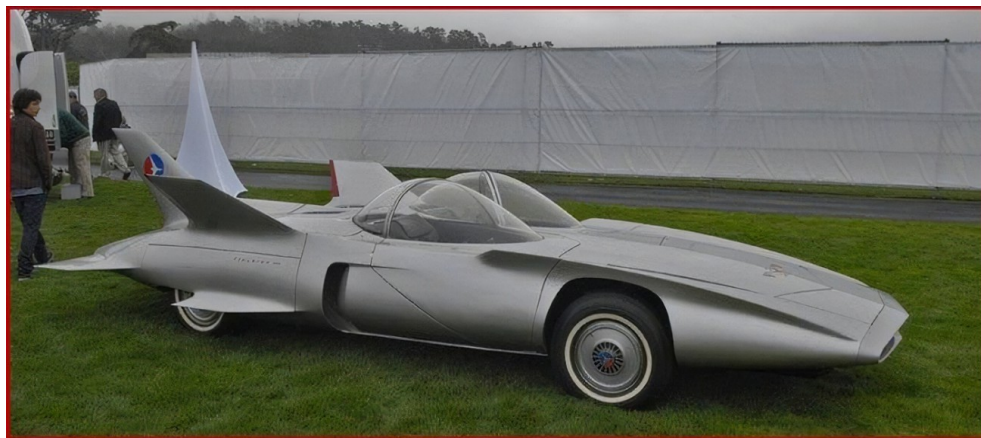
1959 GM FIREBIRD III