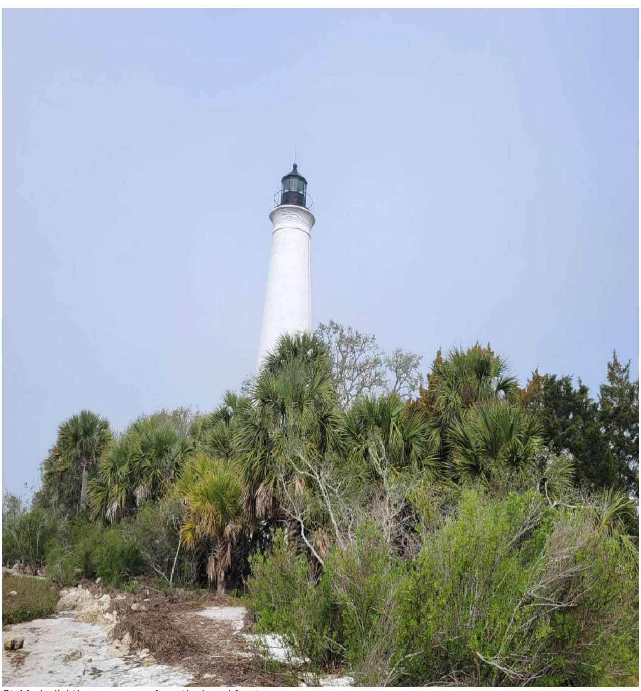
St. Marks lighthouse as seen from the beachfront.