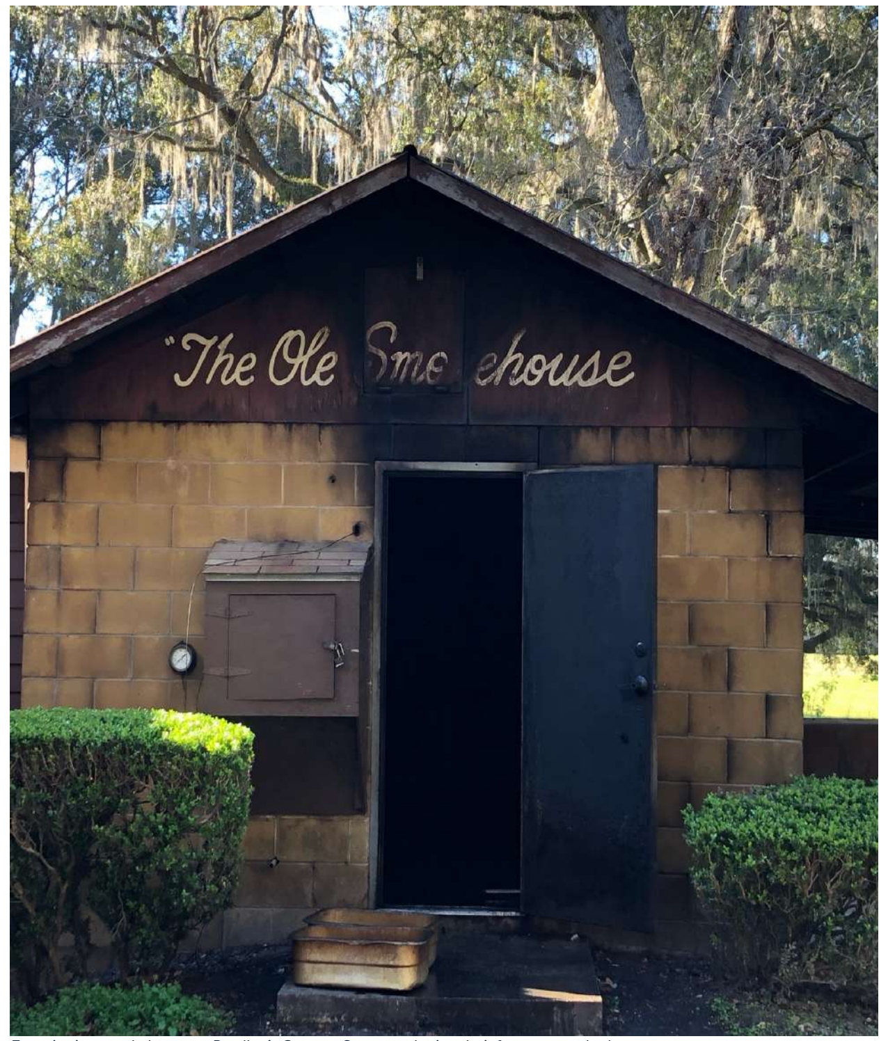
Functioning smokehouse at Bradley's Country Store producing their famous smoked sausage

A southern style buffet awaited us at the Market Diner in Thomasville, GA. The proprietors and staff were very welcoming and truly enjoyed looking at our vintage automobiles. After lunch we visited the cobblestone streets of Thomasville for some shopping therapy and enjoyed the sights & sounds of