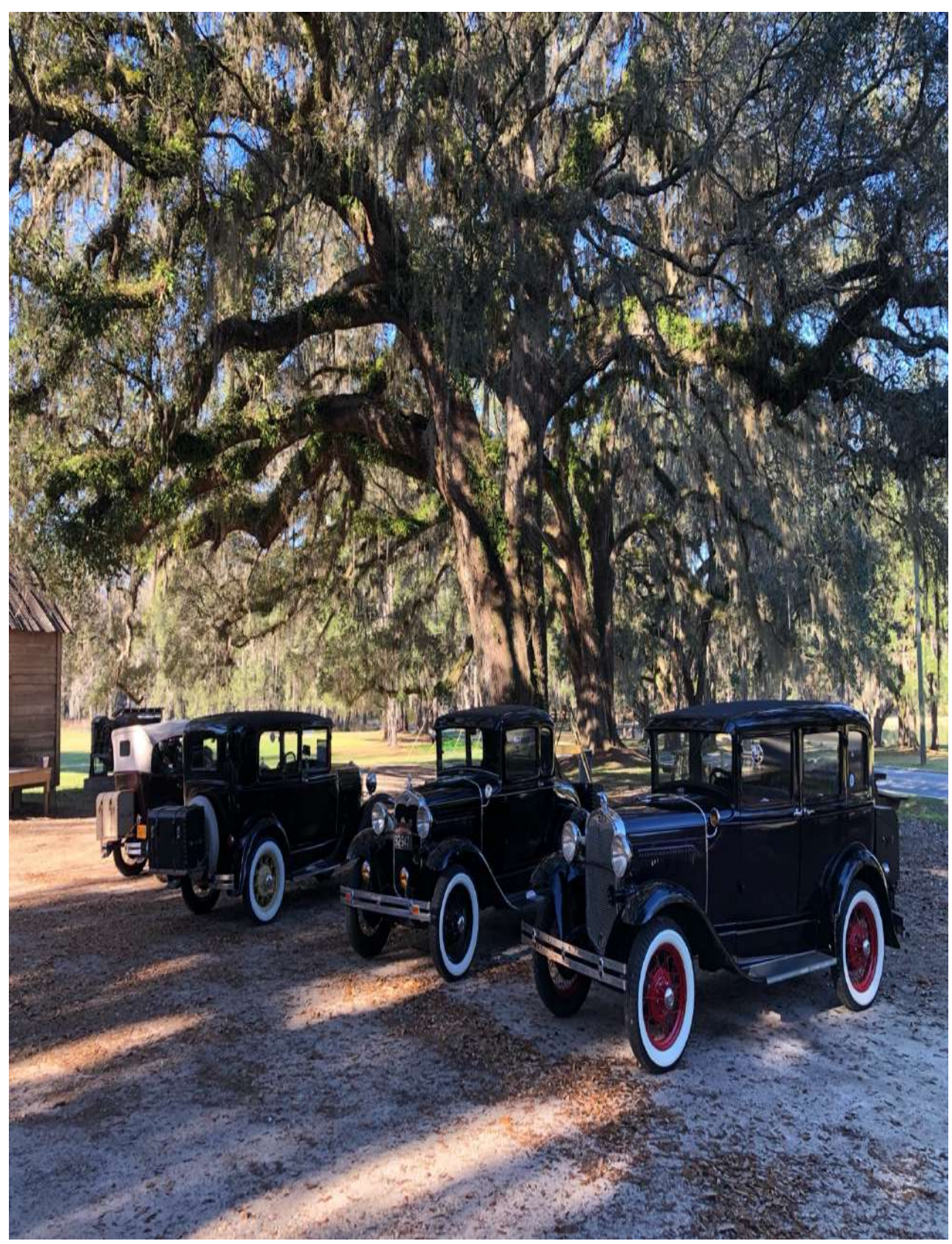
Model A's parked under the grand Oak tree at Bradley's Country Store