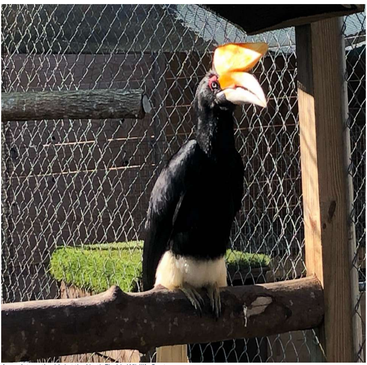
A very interesting bird at the North Florida Wildlife Center

Day 3 started with the tour leading us to the North Florida Wildlife Center in Lamont, Fl. The center is renowned for captive breeding of endangered animals to prevent extinction. These efforts have had a positive impact around the globe. It was evident the animals were well cared for and spirited making this venue one of the most visited in North Florida. Upon completing our visit, it was off to the town of Monticello for lunch and then our final destination to the Tallahassee Automobile Museum.