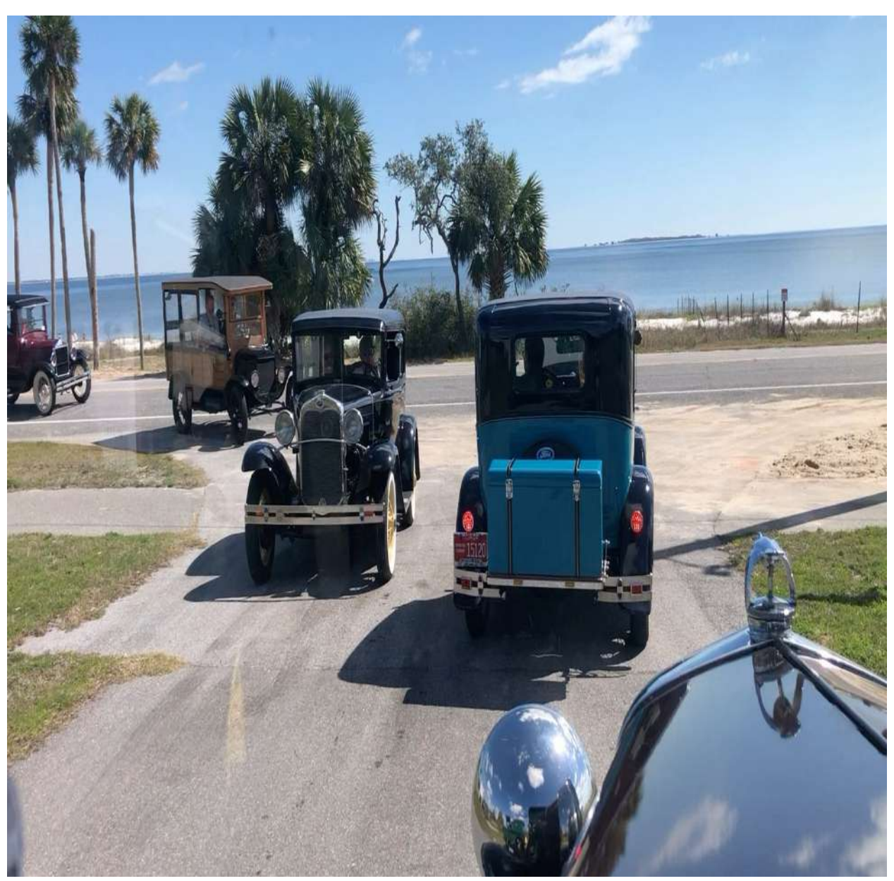
Mode A/T Touring groups coming and going at the Gordon Johnston WW II Museum

After lunch in the seaside town of Carrabelle, we visited the Gordon Jonston WWII museum to honor our veterans and were reminded of the sacrifices made by so many of our fellow citizens. Camp Gordon Johnston was established in 1942 to train US Army infantry with amphibious vehicles along the shoreline. Over 250,000 infantry men were trained to support the war effort until the camps closing in 1946. It was good to be reminded of the sacrifices and how blessed we truly are to live in the USA.