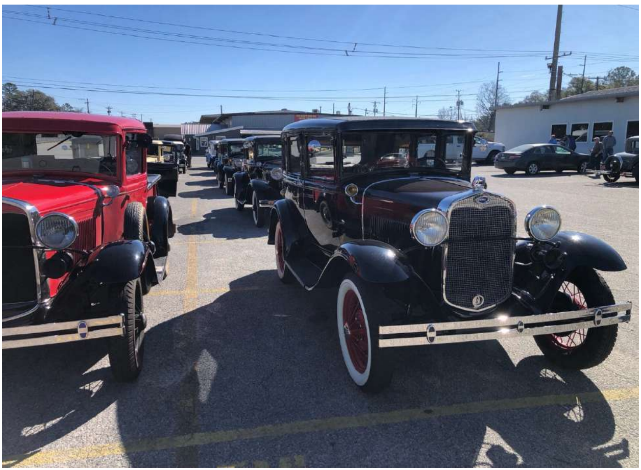
Touring line up at the Market diner in Thomasville, Ga.

this beautiful southern gem. Some of the group returned for more time at the Tallahassee Auto Museum. What a great way to end our day.