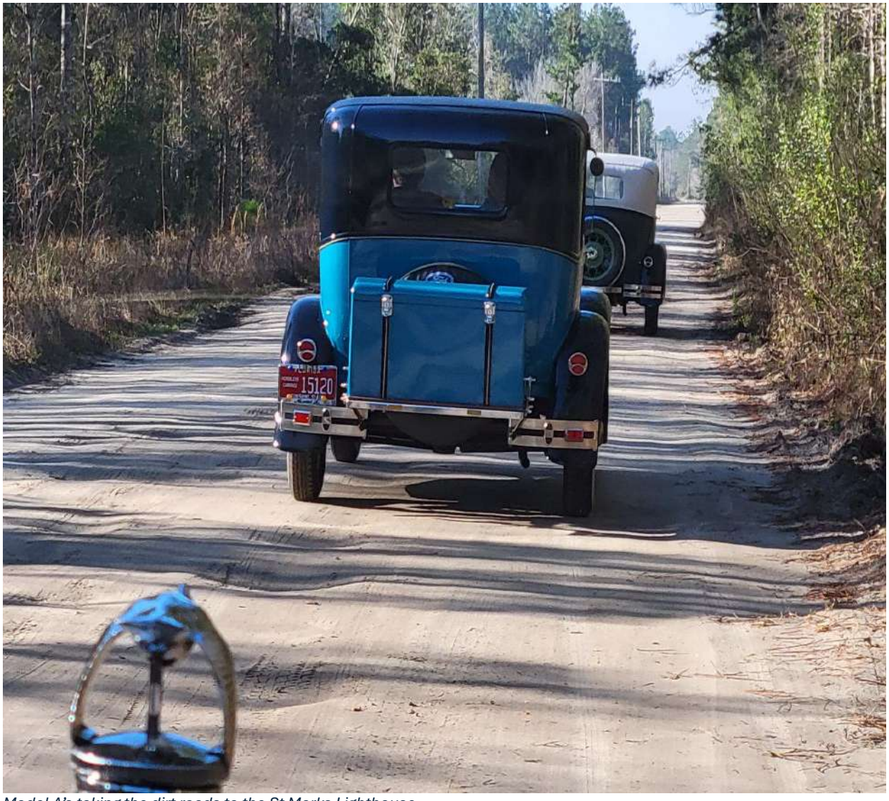
Model A's taking the dirt roads to the St Marks Lighthouse.

Day 4 included a tour to Wakulla Springs State Park and the lighthouse at St. Marks National Wildlife Refuge. In addition to touring through beautiful coastal communities we also experienced some dirt road driving! Within the Refuge there were many opportunities to enjoy viewing the wildlife in their natural habitats. On the peninsula of the refuge was the St. Marks Lighthouse. Built in 1829 as a navigational aide, the lighthouse also has a unique history related to the civil war as costal raids were a primary means of attack against the Confederacy in Florida. Today the lighthouse stands as a prominent structure in the refuge and a popular tourist destination.