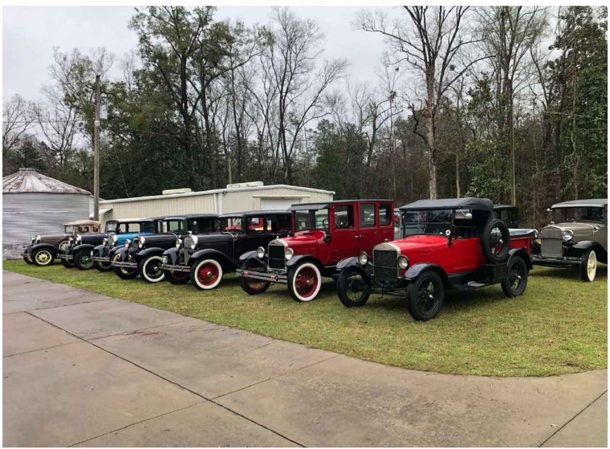
Morning line up at private collection

The day began with rain, but that did not dampen our enthusiasm to get out and drive! Our 1<sup>st</sup> stop was a private collection which housed some unique antique automobiles, motorcycles, and memorabilia. We spent several hours admiring these unique pieces of rolling history. Our hosts were very gracious, and we very much appreciated the hospitality.