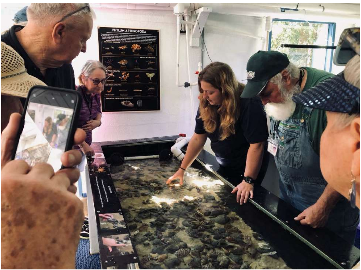
Our tour guide at the Gulf Specimen Marine Lab educates the group on Florida's local shellfish habitat.

The Gulf Specimen Marine Lab is an interactive lab meant to educate, rescue, and protect Florida's native spices through research and outreach. Unlike most aquariums the lab focuses on smaller fish & crustaceans including several invasive species. Being new to Florida we were educated on many local species and how they interact and support the ecosystem.