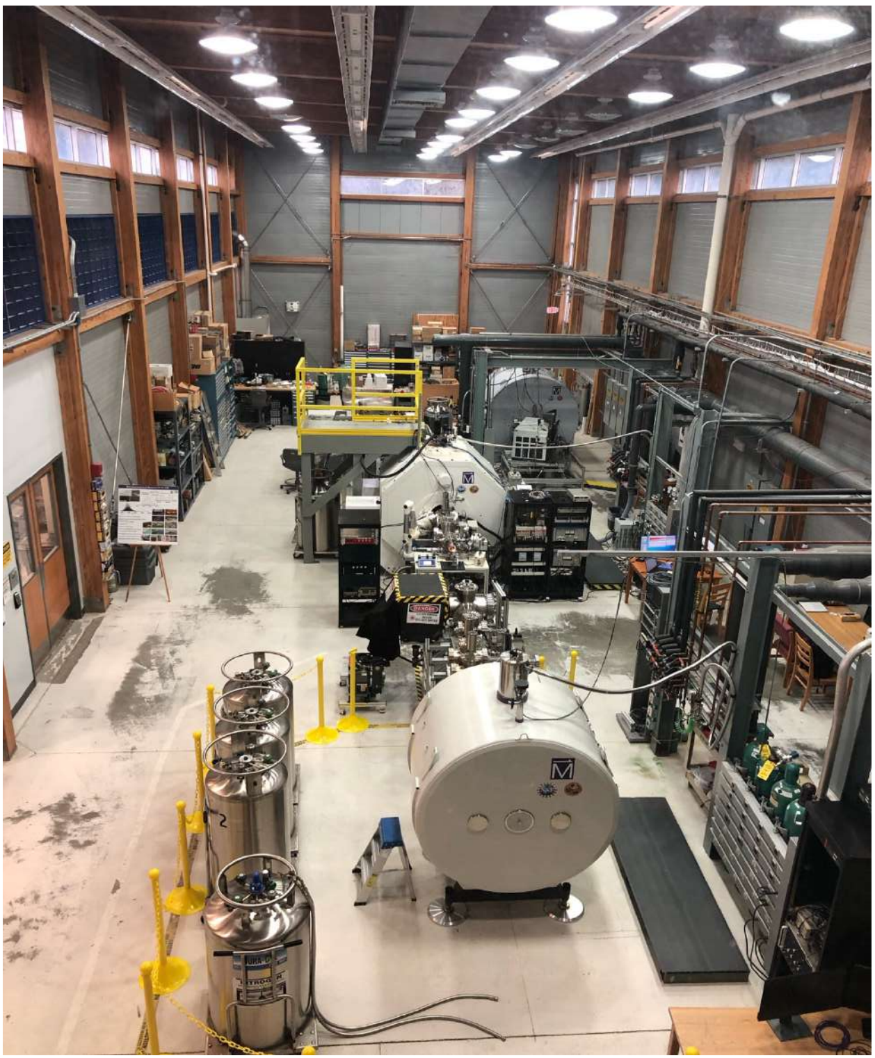
View of one of the many National Maglab's testing rooms

The final stop of the day was the Tallahassee Museum. A collection of historical buildings, and trails/boardwalks from which to view Florida wildlife in its native setting as well as car-parts sculptures throughout the 52 acres.